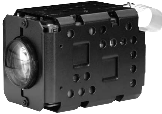
Built-in Optical Zoom Lens

GMC-655PX 23x Zoom, ExView, RS-232TTL, PAL