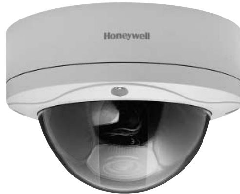
4~9mm lens supplied with camera

Vandal Proof Dome, Varifocal, IP66, DC Drive